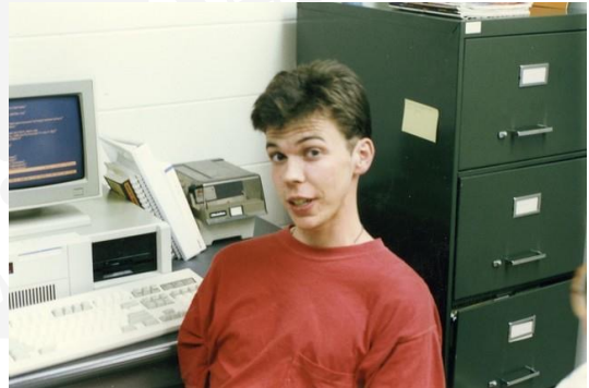
Figure 1: Some skinny nerd, 1990