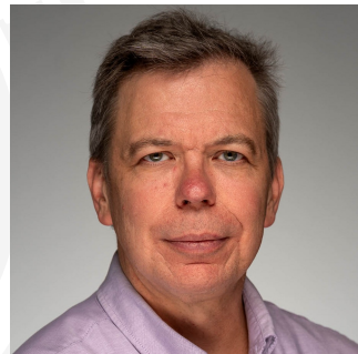
Figure 2: Same nerd, not remotely skinny, 2023