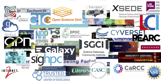
Figure 3: We have lots more groups (Cragin)